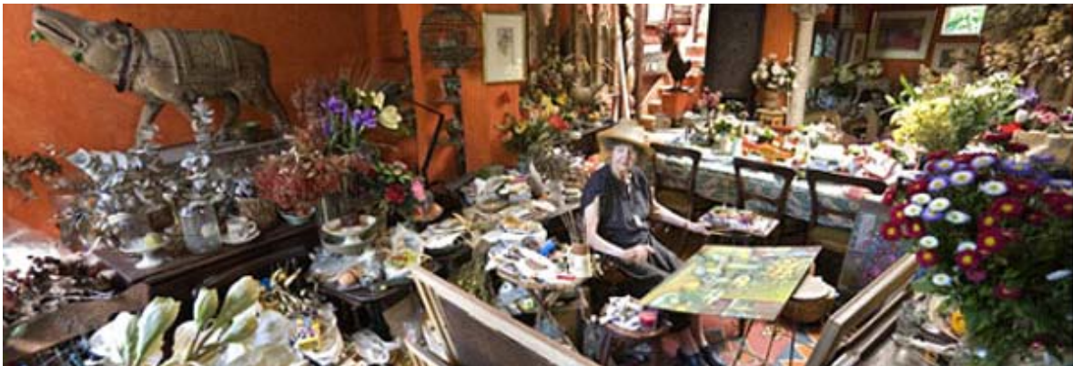
Margaret Olley in her Studio

Margaret Olley died 26 July 2011 aged 88 years old. One of Australia's most distinguished painters and supporters of young and emerging artists, Olley was made a Member of the Order of Australia in 1991. Olley had a saying that haunts and inspires my efforts in painting.